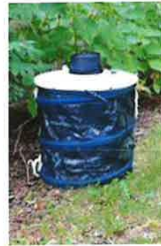
BG Sentinel Trap

If you have any questions or would like to learn more about our program, please feel free to contact us