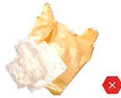
NO Loose Plastic Bags, Bagged Recyclables or Film

Check local drop-off programs for proper disposal