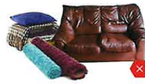
NO Clothing, Furniture & Carpet

Empty recyclables directly into your bin.